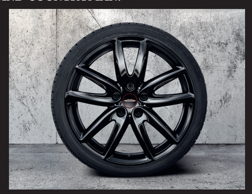
18" John Cooper Works Grip Spoke black