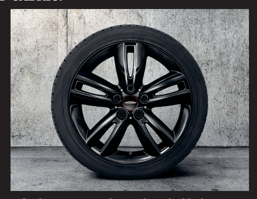
17" John Cooper Works Track Spoke black