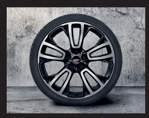
19" John Cooper Works Circuit Spoke 2-tone