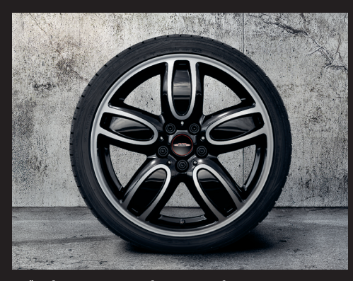
18" John Cooper Works Cup Spoke 2-tone