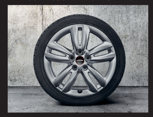
17" John Cooper Works Track Spoke