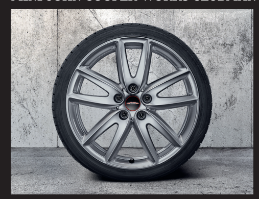
18" John Cooper Works Grip Spoke