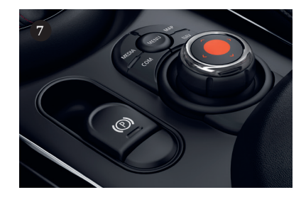
① Convenient Split Doors and 360–1250 litre luggage capacity. ② 18" alloy wheel Multi-ray Spoke 2-tone. ③ Panoramic glass sunroof. ④ Hassle-free luggage access thanks to the Easy Opener function. ⑤ Automatic air conditioning | Chrome Line interior. ⑥ MINI Head-Up Display. ⑦ Electric handbrake.