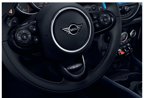
① MINI Yours leather Lounge Carbon Black seat* | MINI Yours Piano Black illuminated interior style. ② Sports seat in leather Chester Malt Brown* | MINI Yours Frozen Blue illuminated interior style | Loading system with 40:20:40 folding rear seats. ③ Ambient lighting with 770 different colour shades (part of the optional MINI Excitement package) | MINI Yours Frozen Blue illuminated interior style. ④ MINI Yours leather sports steering wheel.