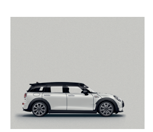
White Silver 1/2