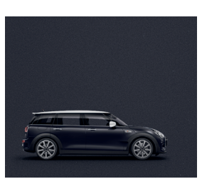
Thunder Grey 1/3